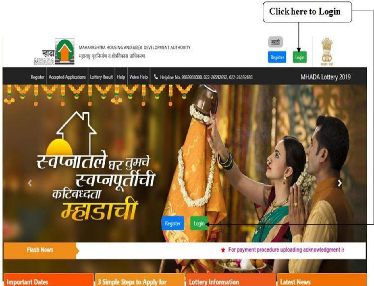
Fig. No.: 1