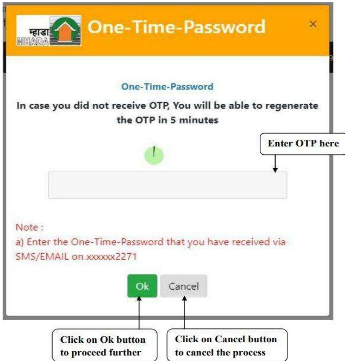
Fig. No.: 3